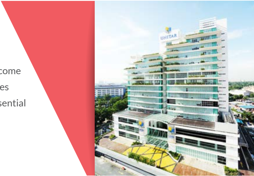
MAIN CAMPUS: UNITAR International University Kelana Jaya.

The Faculty of Education and Humanities offers a selection of professionally designed courses ranging from Education and English, to Communication and Guidance Counselling. If your interest lies somewhere within, we welcome you to the UNITAR experience that incorporates academic learning at its best with soft skills essential to the 21st century workplace.