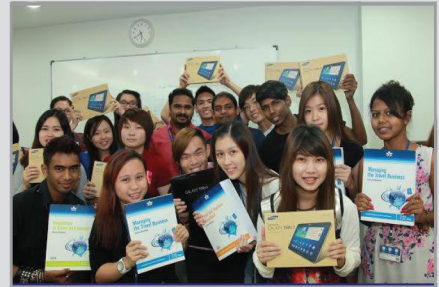
Students getting their free Samsung Tab