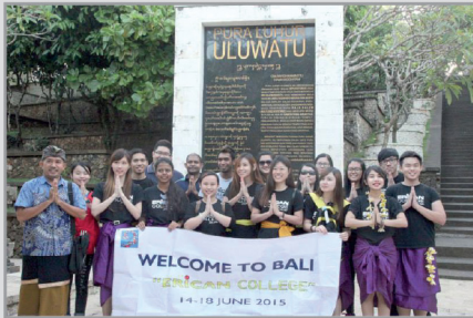
Overseas practical tour leading trip to Bali