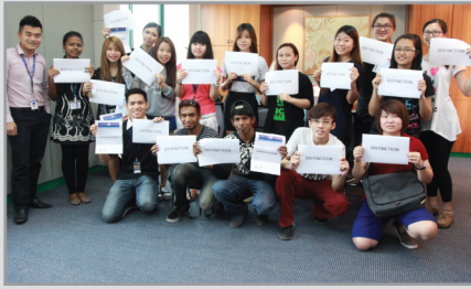
Highest scoring ATC in the Asia Pacific region with 100% Distinction scorers and two Top Student award recipients in IATA's June 2014 exams