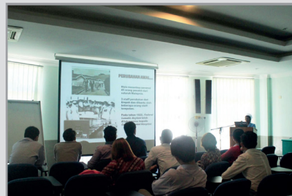
Learning how patients are treated and cared for at Hospital Bahagia Ulu Kinta