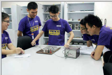
Trying apparatuses and tests used in psychological experiments at IIUM