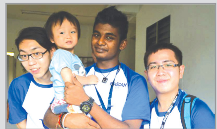
Running charity snack drive with all proceeds going to Rainbow Home, Cheras