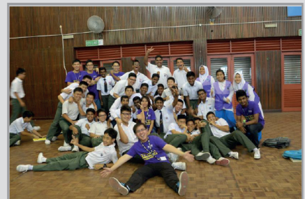
Conducting mini workshop on human memory at SMK Subang Jaya