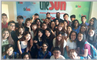
The Sun Daily