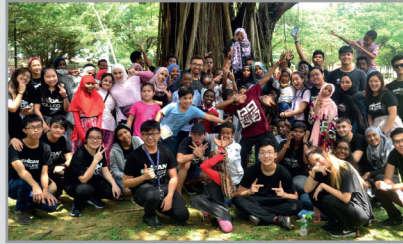
Charity Work With Refugees