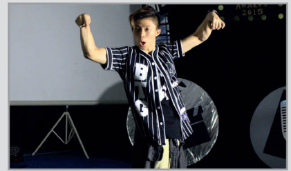
Cinemasscomm Awards 2015