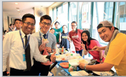
Mini Venture... Let's Start Up!