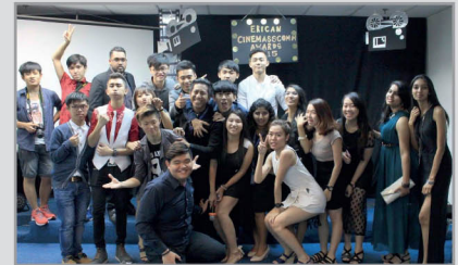
Cinemasscomm Awards 2015