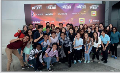
Asia's Got Talent at Pinewood Iskandar Malaysia Studios