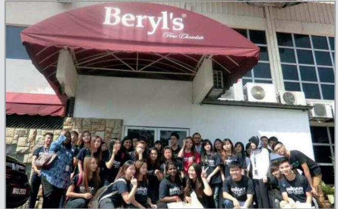
Beryl's Chocolate Kingdom