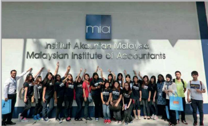
Malaysian Institute of Accountants