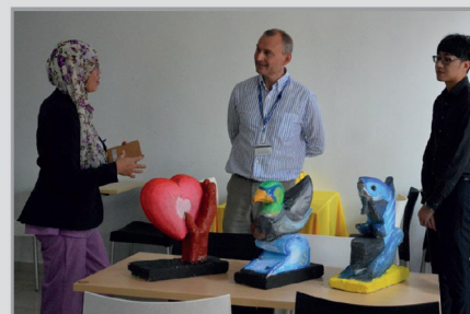
Assisting at the Culinaire Malaysia competition organized by Food & Hotel Malaysia 2015.