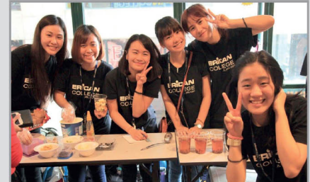
Health is Wealth