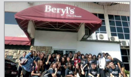
Beryl's Chocolate Kingdom