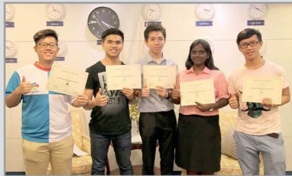
Finalists in KLSCCCI's Innovative Youth, Future Business Leader 2.0 competition