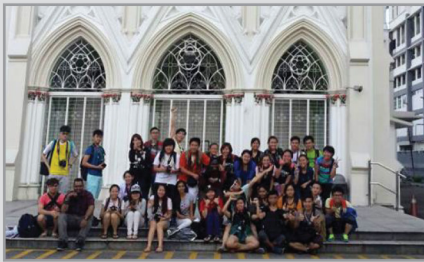
Digital Photography class assignment.