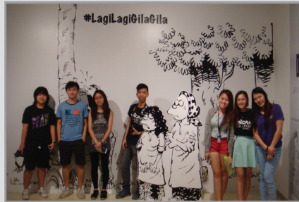
Lagi-Lagi Gila-Gila exhibition at Galeri Petronas.