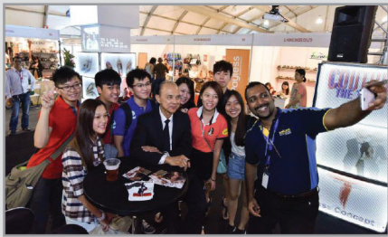
Top 5 and most Facebook 'likes' in the MISF 2015 Killer Heels Design Competition.