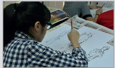
Quick sketching in Drawing 2: Useful warm-up exercises that are more fun and free spirited.