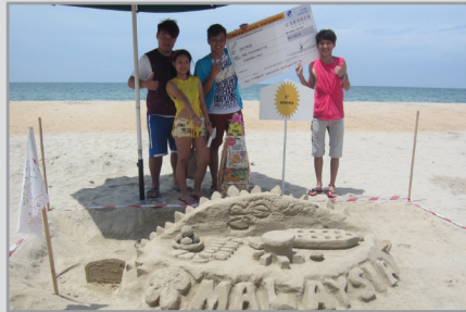
Runner-up in the 24th Annual Cherating Sandsculpting Competition.