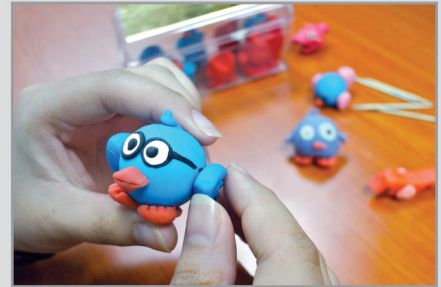
Character modelling in Graphic and Animation: Students learn to use sculpting techniques to create a 3D clay model.