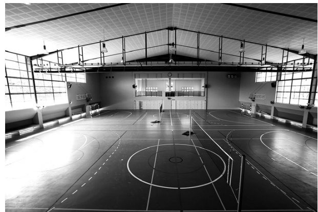
Sport Hall, Tun Taib Hall