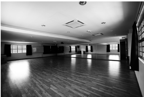
Performing Arts Studio, Tun Taib Hall

Each cluster of classrooms in the primary sections and the specialist rooms have their own block of toilet facilities. For Kindergarten One and Two, the classrooms have their own individual ensuite toilet facilities.