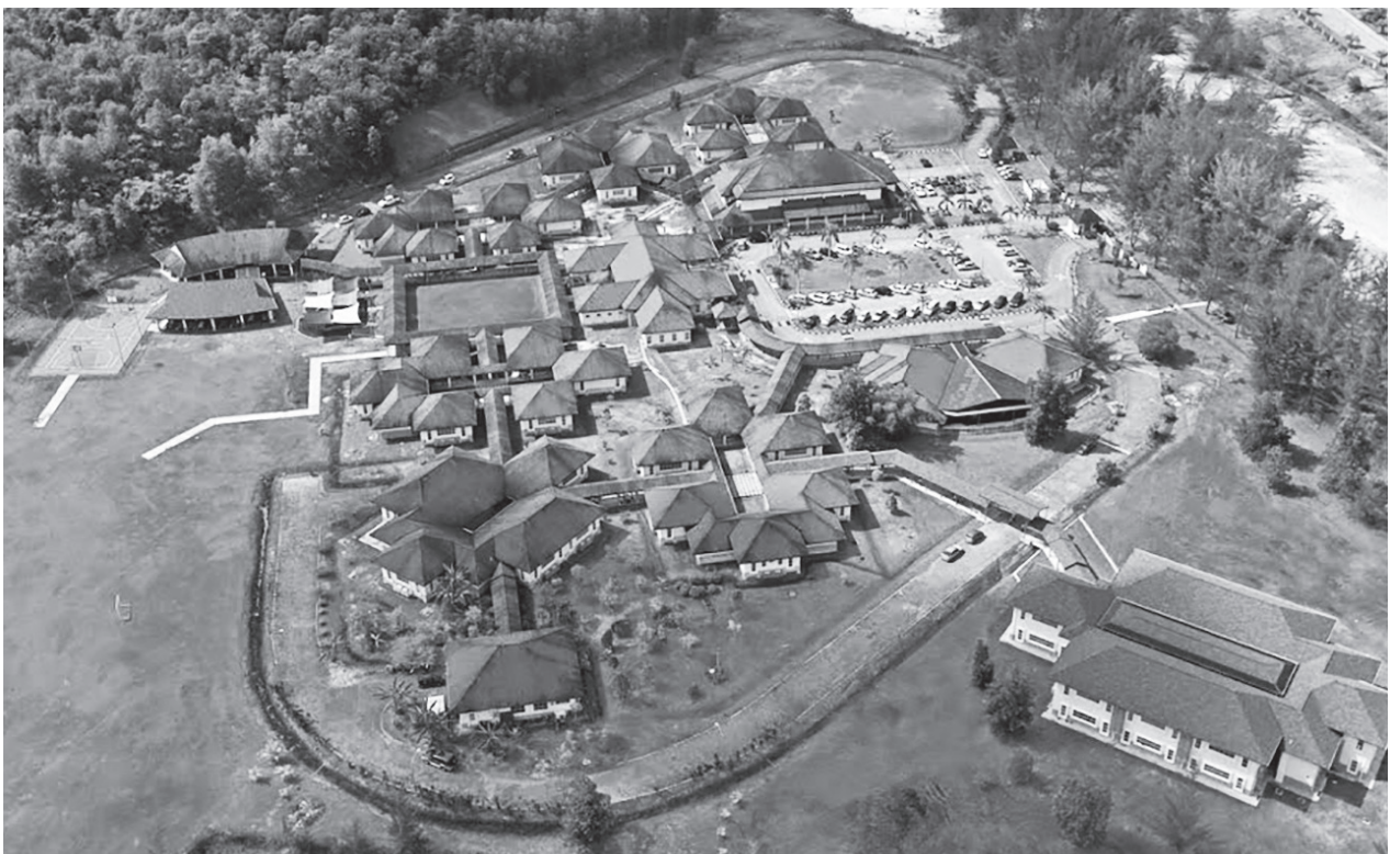
Aerial view of Tunku Putra School