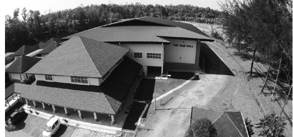
Tun Taib Hall

In May 2015, the Governor of Sarawak opened the magnificent Tun Taib Hall named in his honour, with two competition-sized basketball courts, also marked out for netball, futsal, volleyball and handball, a dance/drama studio and a fitness room.