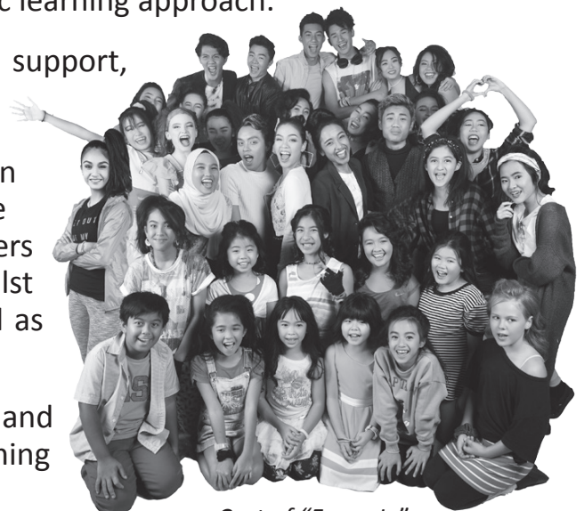
Cast of "Fame Jr." (2017 school drama production)

We look forward to turning many new and refreshing pages of our story in the coming days.