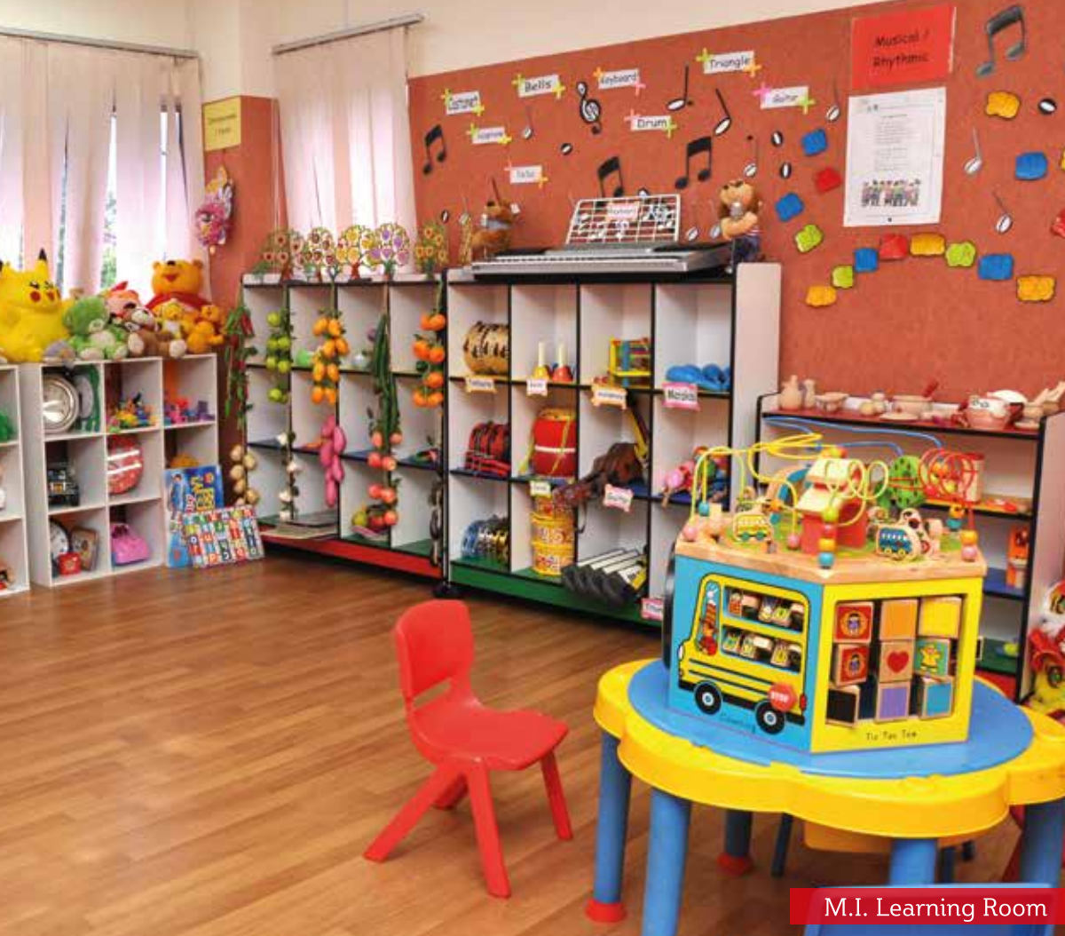
M.I. Learning Room