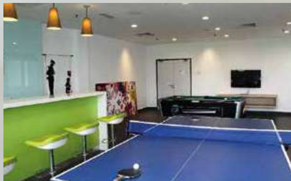
Table tennis and Pool