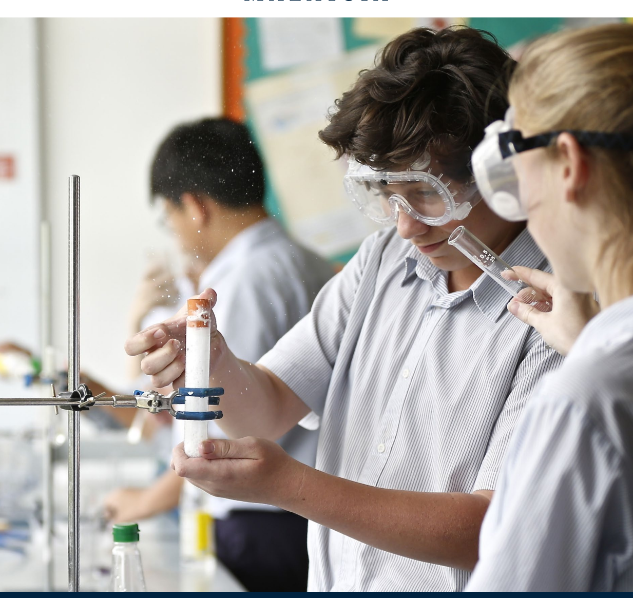
13+ Scholarship Prospectus