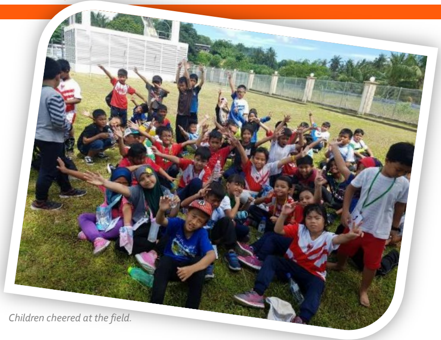
Children cheered at the field.

With full commitment from the teachers, staff, students and parents during the Kids Fun Discovery Camp, this programme was successfully held. Participants enjoyed all the activities and they are looking forward to next year's camp.