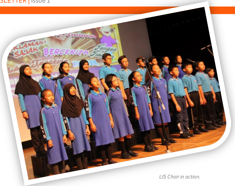
LIS Choir in action.