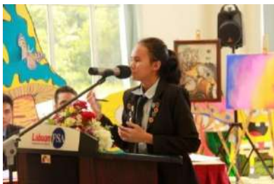
Students gained a lot of experience from this debate competition.