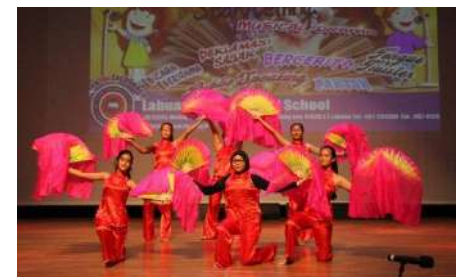
Traditional Chinese Fan Dance

There were about 15 performances that consisted of singing performances, tongue twister, storytelling, choral speaking, musical drama, pantun , deklamasi sajak , bicara berirama and bercerita .