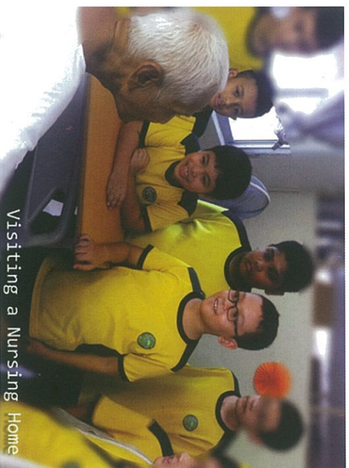
Visiting a Nursing Home