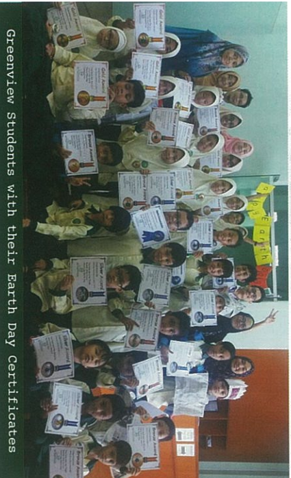
Greenview Students with their Earth Day Certificates