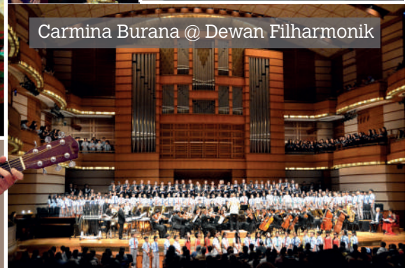
Carmina Burana @ Dewan Filharmonik