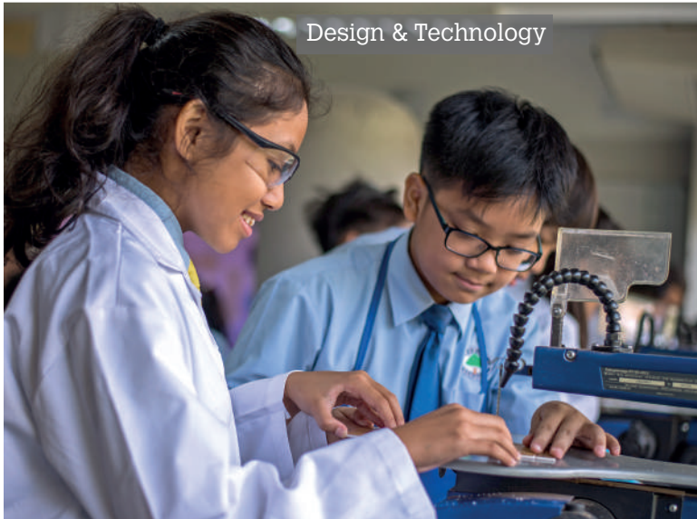
Design & Technology