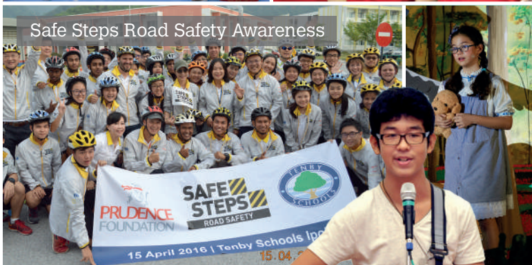
Safe Steps Road Safety Awareness