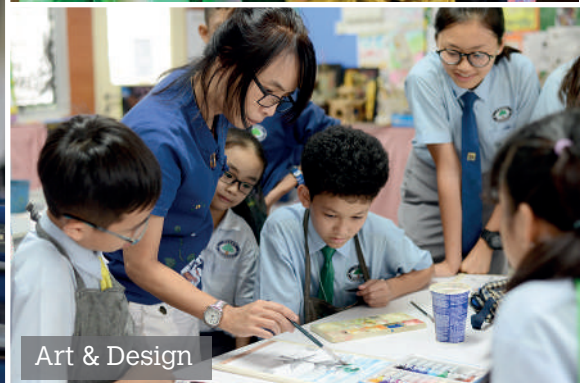
Art & Design